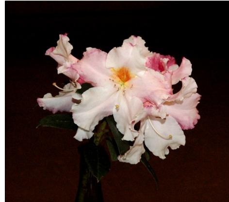
Best of Show 2010

Note: Volunteers on the 12:00 to 2:00 shift can eat lunch at 11:30.