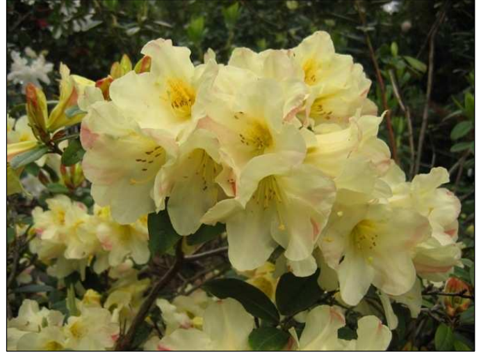
R. 'SpringGold' R. 'Saffron Prince' x R. dalhousiae Hybrid & [Informally known as "The Winner"]