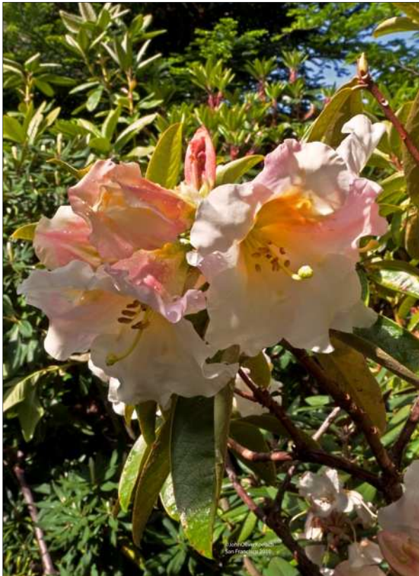
R. burmanicum 'KW' x R. 'Mi Amor' Hybrid